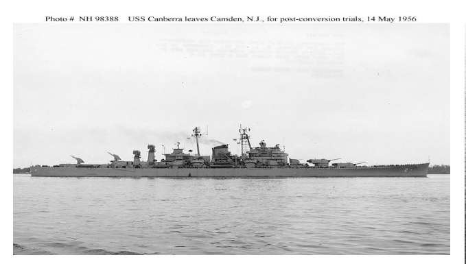
AFT 8" TURRET GONE MISSLES ADDED