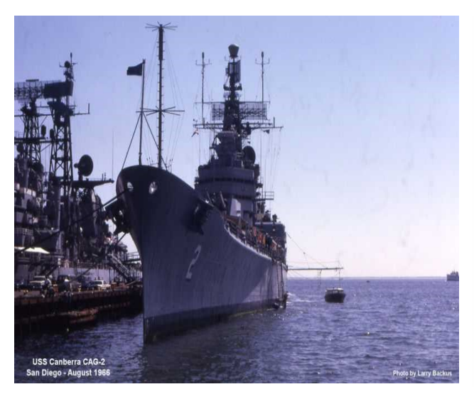
HOME PORTED IN SAN DIEGO 1968