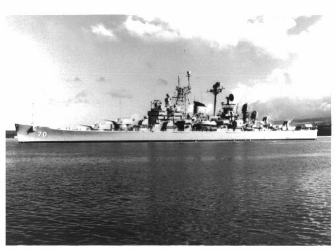
CANBERRA REDESIGNATED AS CA 70

Photo # USN 1122618 Cleaning an eight-inch gun on USS Canberra, March 1967