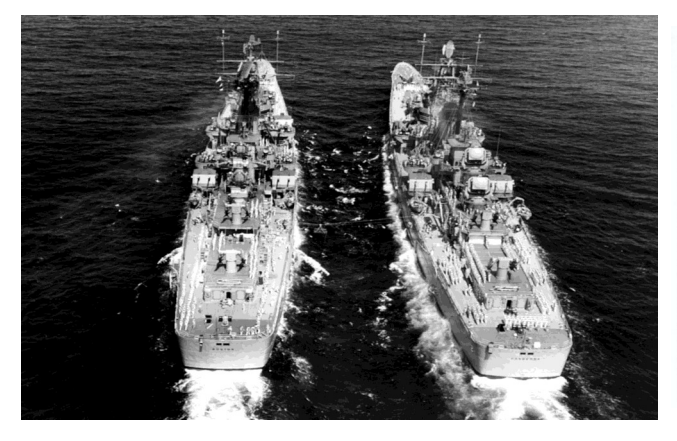
TRANSPORTING, ESCORTED BY BOSTON CAG1 WORLD WAR II UNKNOWN SOLDIER