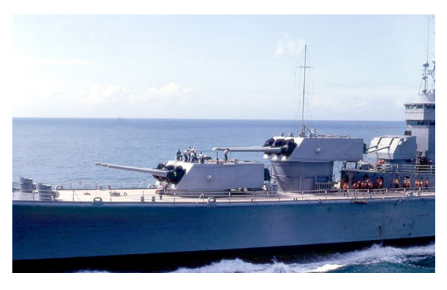
FIELD DAY SKIMMER STYLE

Photo # USN 1122618 Cleaning an eight-inch gun on USS Canberra, March 1967