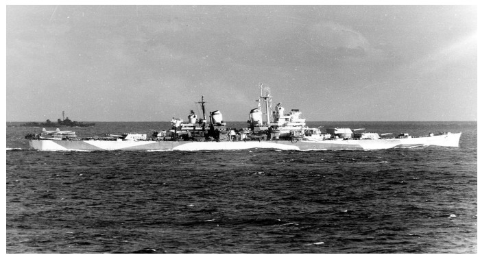
DAZZZLE PAINT STARBOARD VIEW