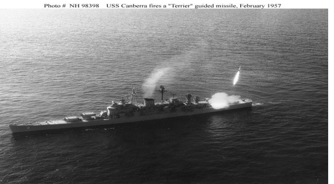
WHAT WE DO