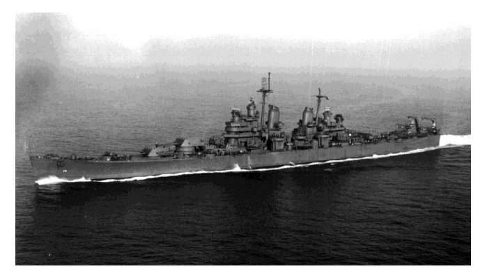
PORT SIDE VIEW OCTOBER 1943